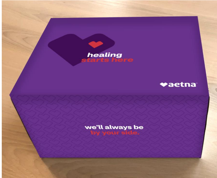
Branded Box w/ Product