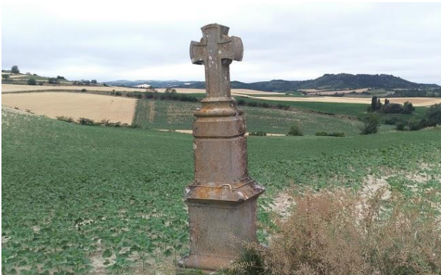
Aware of attackers waiting for him as he walked the fields to Prouille, St. Dominic approached singing in plain view. His courage and faith so impressed the would-be assassins that they converted on the spot now known as the Assassin's Cross.