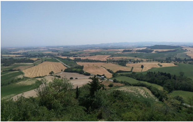
On three successive nights in July 1206, St. Dominic was praying on the hillside of Fanjeaux, France, and saw a ball of fire hover over nearby Prouille. He took this as a sign that this was where he should center his mission. This hillside is now called 'Signadou' or 'sign from God.'