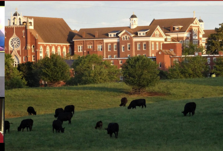
St. Catharine Farm cows grazing in the field outside of the Motherhouse.