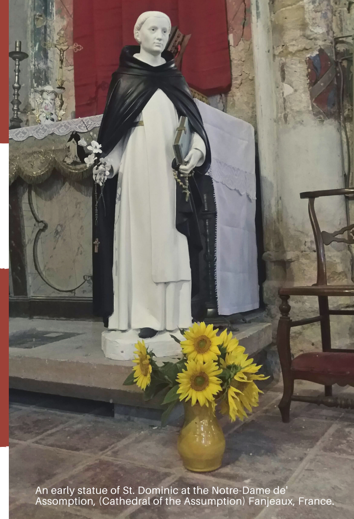
An early statue of St. Dominic at the Notre-Dame de l'Assomption, (Cathedral of the Assumption) Fanjeaux, France.