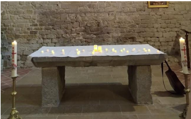
At the center of the chapel in the Holy Family Convent in Fanjeaux, France, is the altar at which St. Dominic prayed. St. Dominic was known to have used nine distinct postures of prayer to reflect gratitude, penance, intercession and joy.

Like our Patron, St. Dominic, in a time of social, political and religious polarization, the Dominican Sisters of Peace continue our work to