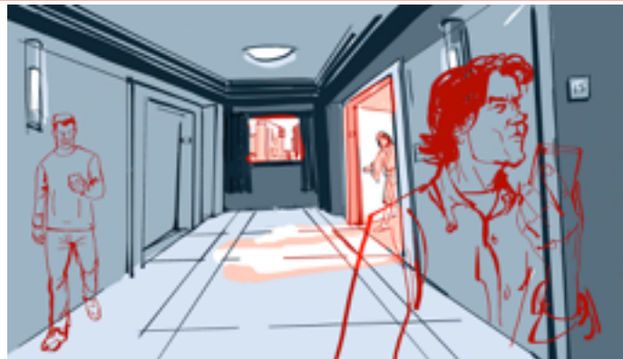
Illustration by Gabriel Campanario/The Seattle Times/July 26, 2017

In the third issue of Dignity: A Journal on Sexual Exploitation and Violence the editors present papers and videos from The Freedom from Exploitation Agenda briefing, held March 20, 2017 at the U.S. Capitol and hosted by Senator Orrin Hatch.