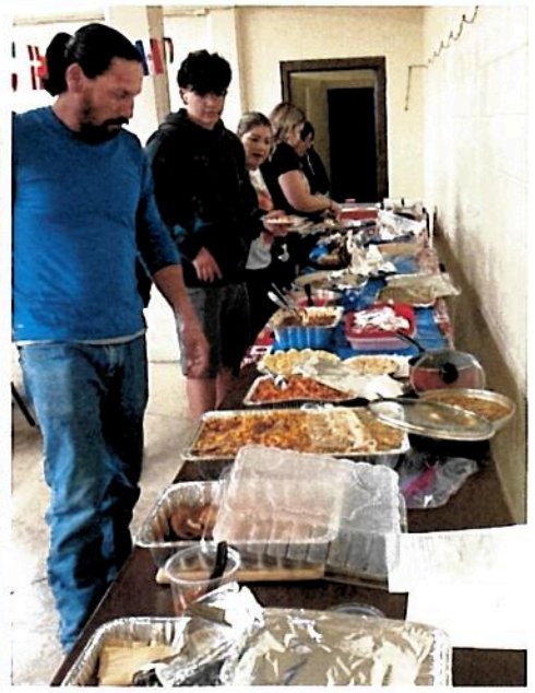
Above: some of the learners and teachers at St. Mary-Magdalene at the end of year celebration on May 23, 2022