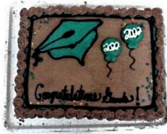
ESL parish sites celebrate the end of the academic year with lots of great food and sharing about the countries from which they come. Countries represented included: Mexico, El Salvador, Costa Rica, the Dominican Republic, Ecuador, and Venezuela.