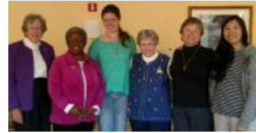
Retreat group picture.