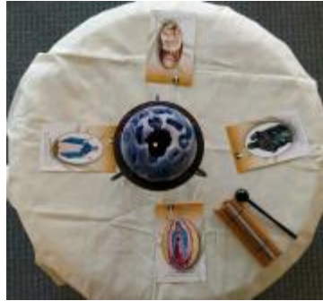
Center table in chapel with Vocation Prayer cards with different culturally diverse depictions of Our Lady.