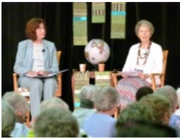
Assembly Speakers from National Catholic Reporter

We are already looking forward to next year in St. Louis when we will gather to celebrate our 10 th anniversary as a Congregation.