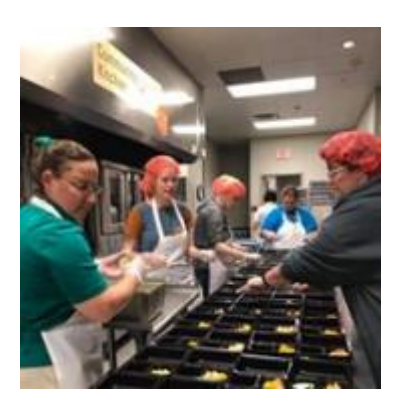
Participants volunteer with the Mid-Ohio Foodbank.