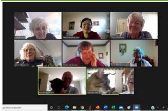
The "HopeSeekers" study group

support, access to mental health help, ways to prevent violence, and help with job searches.